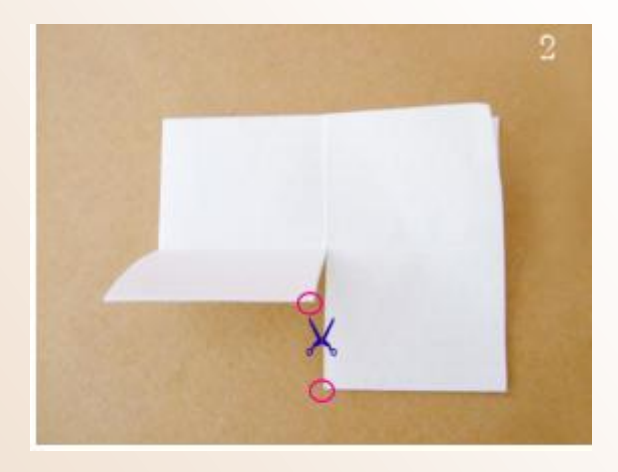
Fold up a quarter. Make a slit in the middle.