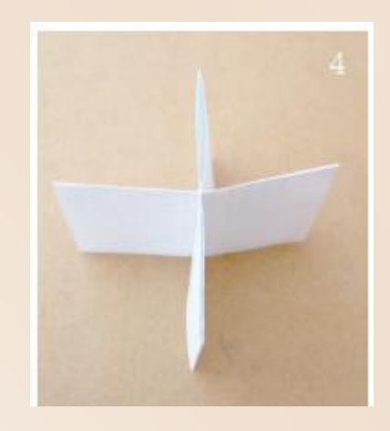
Bring together as shown.