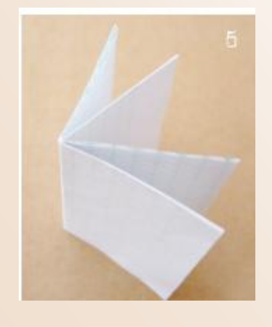
Gather up as shown.